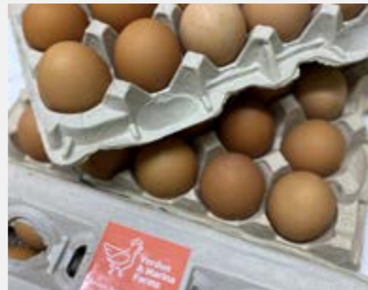
Above: Chicken farm, eggs