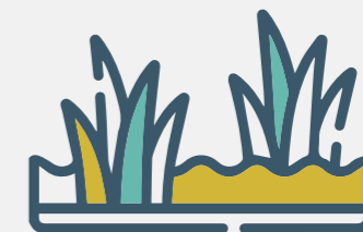
Lawn & Garden Maintenance